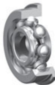
Flanged Ribbon Cage