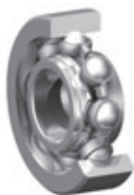
Unflanged Ribbon Cage