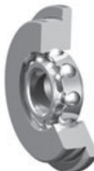
Flanged Crown Cage