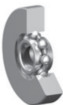
Unflanged Ribbon Cage