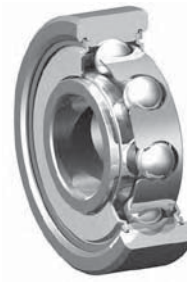
Shielded Crown Cage