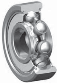
Unflanged Shielded Ribbon Cage